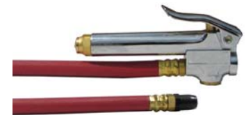
Model number: A1300 (A1300-DPB for display packaging)