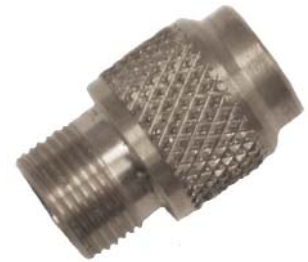
A680-ADP enlarged to show detail

PLEASE NOTE: While the use of Safety tips keeps the Typhoon OSHA compliant, Non-Safety tips used on the Typhoon via this adapter render the Typhoon Non-Safety while such tips are used.